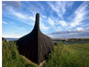
Viking ship in Lindisfarne

2775.800.7440 inganorsk@gmail.com www.daughtersofnorway.org