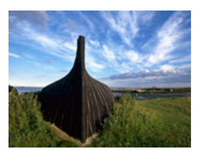
Viking ship in Lindisfarne

2775.800.7440 inganorsk@gmail.com www.daughtersofnorway.org