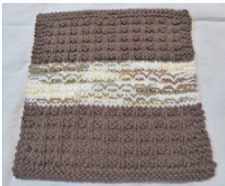
Waffle Knit Dish Cloth