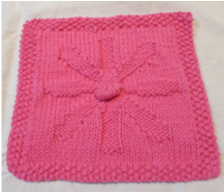
Daisy Dish Cloth