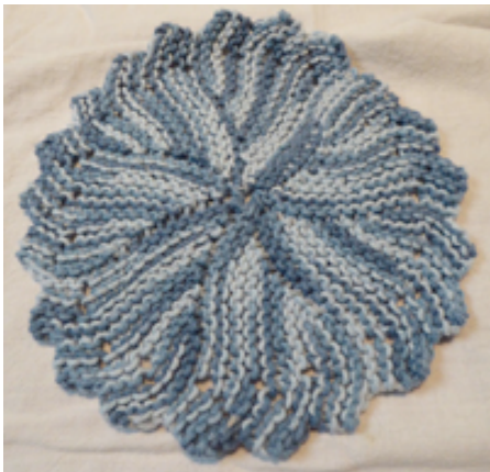
Round Dish Cloth