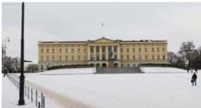
Slottsparken (Norwegian Palace) in January