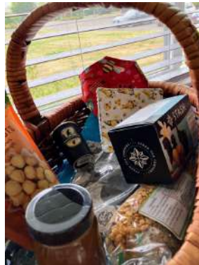
Basket being donated to SCF Dinner