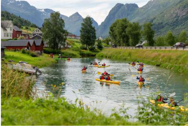
Olden, Norway in July