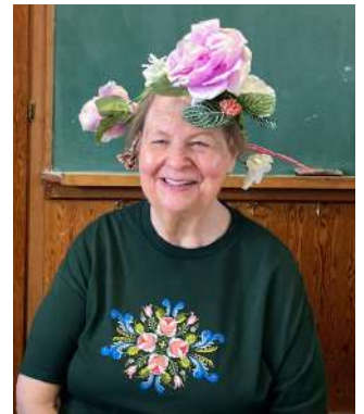
We do have fun!!